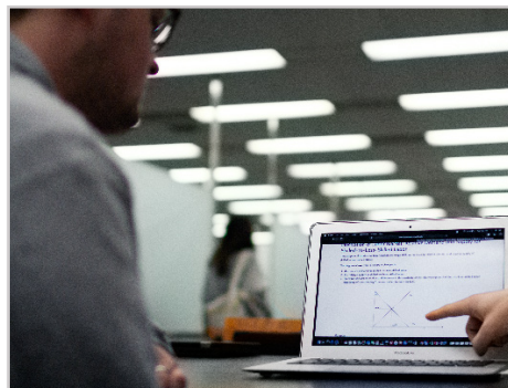
Students using EconPractice to study concepts in preparation for their next class.